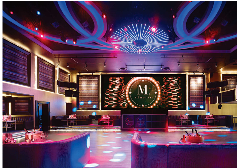
From top, Mémoire at Encore Boston Harbor and the Topgolf Swing Suite at MGM Springfield.