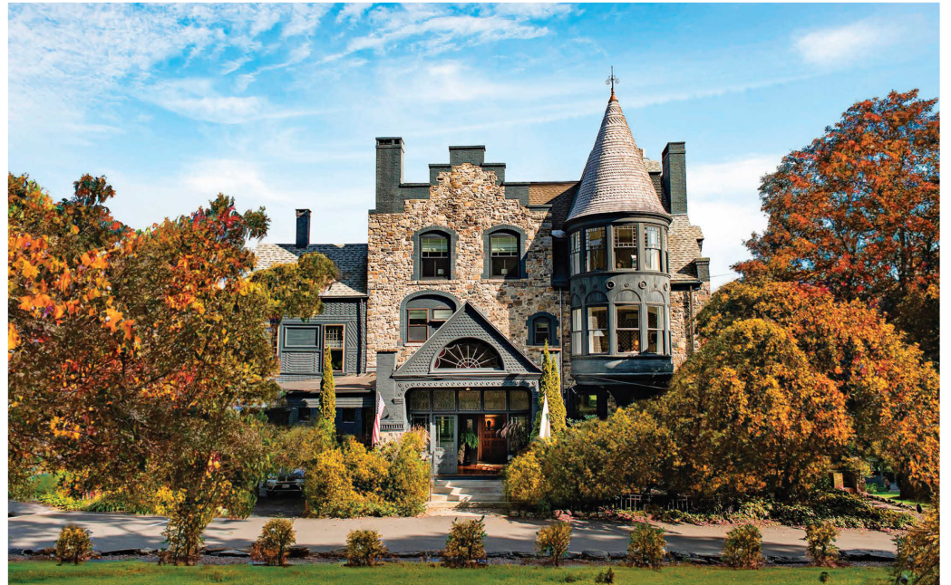
Clockwise from top, the Norumbega, Lumen Nature Retreat, and Blind Tiger.