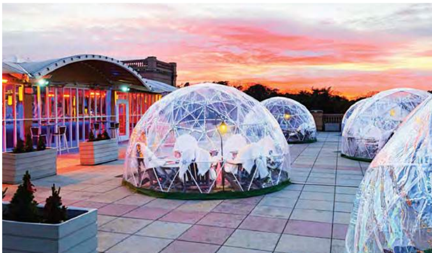
The igloos at Ocean Edge Resort & Golf Club.