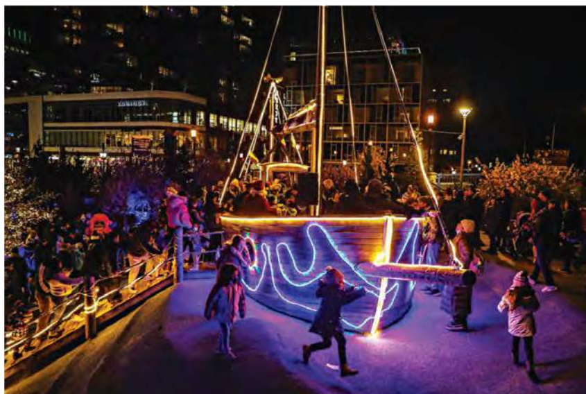
The Holiday Ship Lighting in Martin's Park.

Who says gondolas are just for going up a mountain? At the newly renovated Hermitage Inn in West Dover, Vermont, you can sip and graze inside a repurposed lift after a day on the slopes. Groups of six can sip champagne inside the snug pods and, afterward, stroll beneath the property's very own covered bridge—or opt for a private dinner in the inn's wine cellar, where a seasonal tasting menu is paired with wines from the collection. thehermitageinnvermont.com .