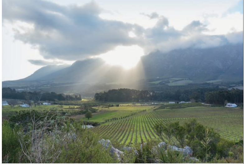
▲ A view of the Hemel-en-Aarde Valley, in South Africa.