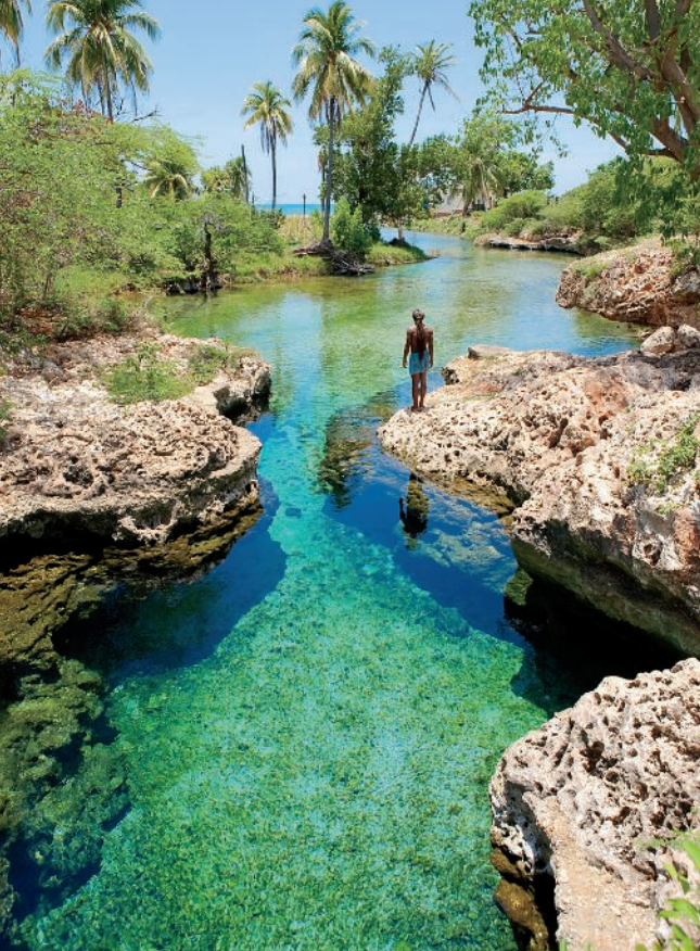
▲ Alligator Hole, a pool on Jamaica's Black River.